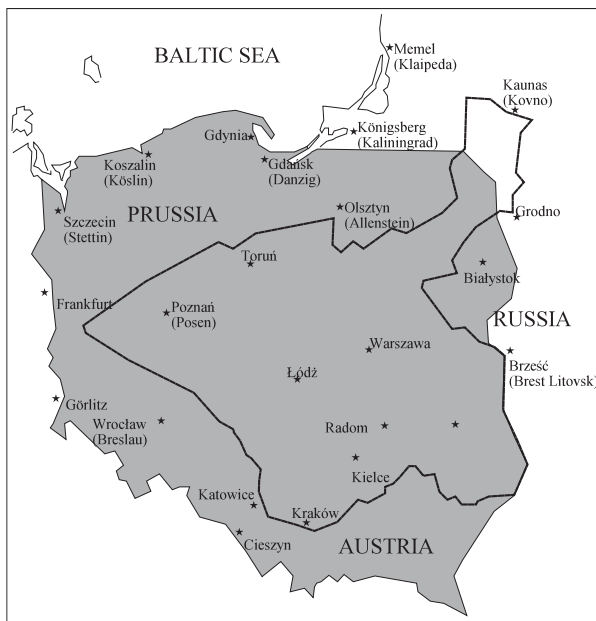
DUCHY OF WARSAW, 1807-1813 (Napoleon)